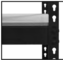
Advanced Boltless Design