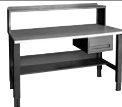
Worksurface with Bottom Shelf & Riser