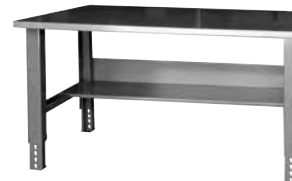
Worksurface with Bottom Shelf