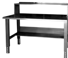
Worksurface with Bottom Shelf & Riser