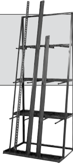
Vertical Stock Rack